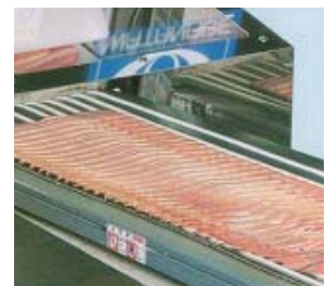
BACON/ SHINGLING SLICE