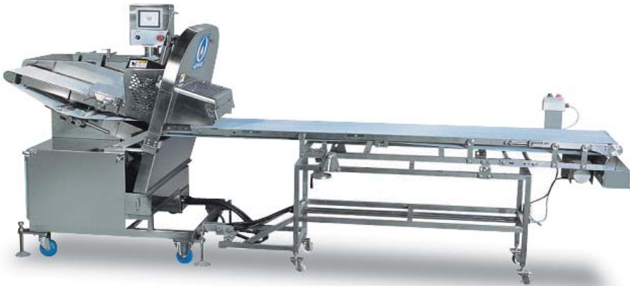
A conveyer on the picture is a normal one, the conveyer length can be changed by the option.

THE FIRST AMONG THE WORLD TECHNOLOGY, 'SCISSORS CUTTING STYLE' CREATED BY OUR HALF CENTURY HISTORY AND TECHNOLOGY.