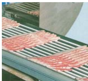
PORK/ INTERMITTENT SLICE