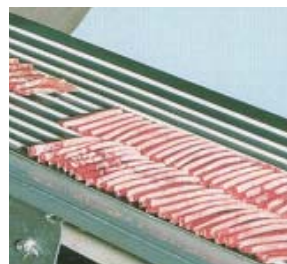
BEEF/ JAPANESE TEPPANYAKI