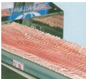
PORK/ SHINGLING SLICE